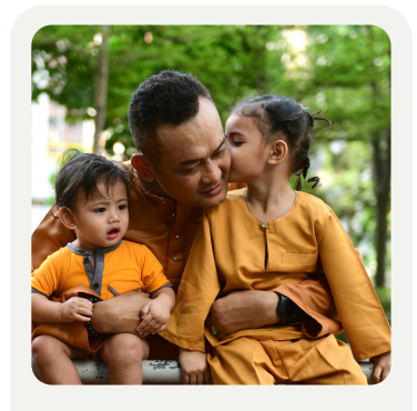
Families incl. single-parents